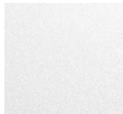
Ivory Silver Gloss