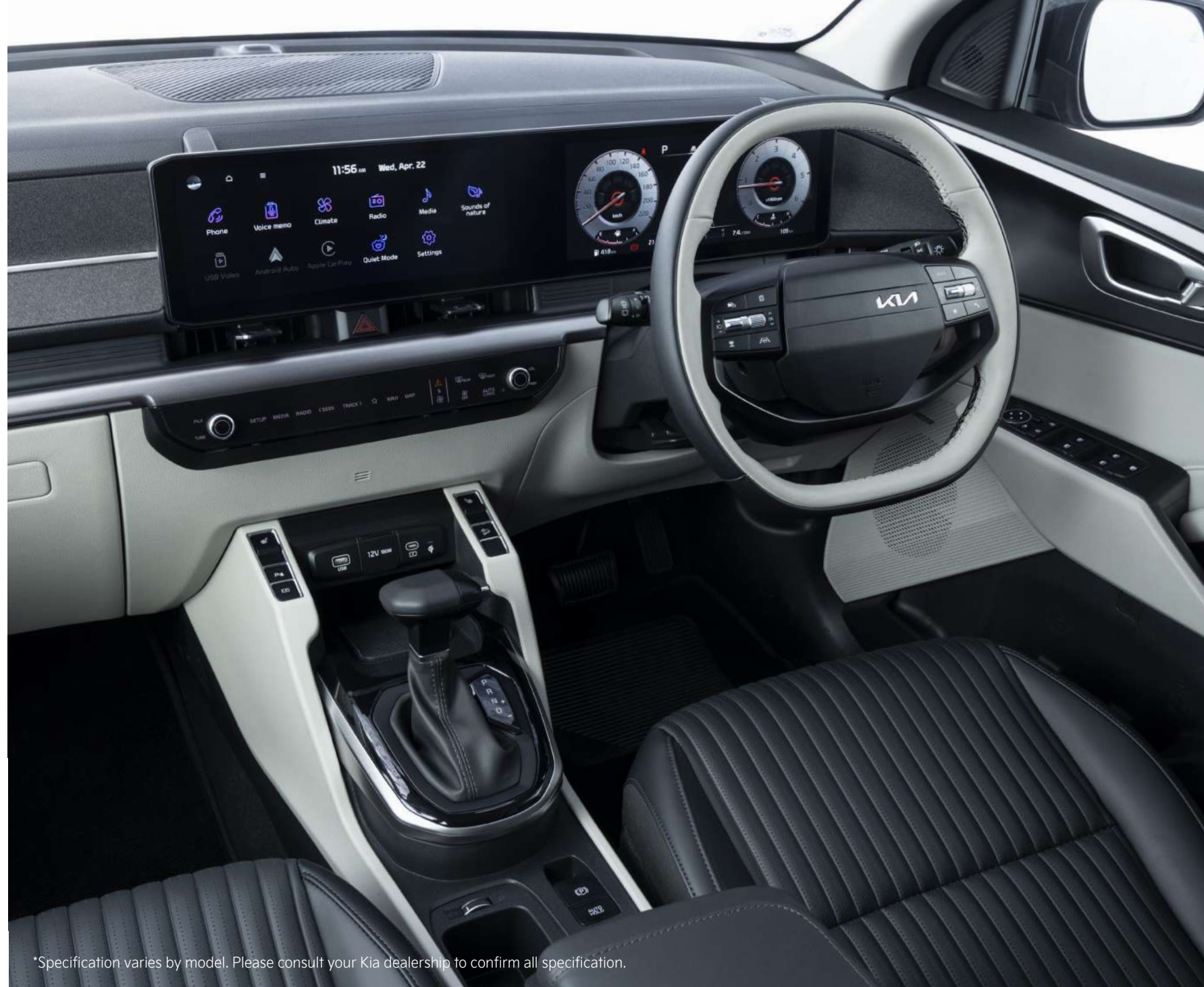
*Specification varies by model. Please consult your Kia dealership to confirm all specification.

The seats keep you comfortable, and the ambient lighting sets the tone, along with a fresh cabin atmosphere. With sound by Bose and thoughtful touches throughout, it's a space that doesn't just impress. In fact, it stays with you.