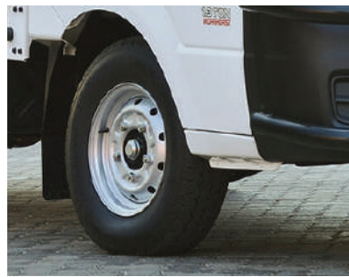
5.0 J x 14" (K2700)