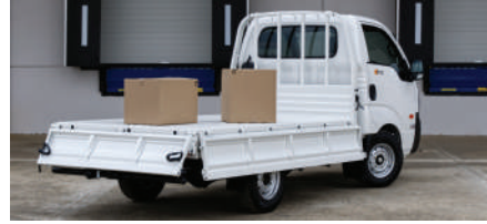
K2700 WORKHORSE WITH AIRCON