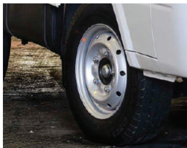
5.5 J x 15" (K2500)