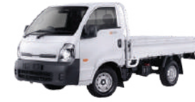
K2700 WORKHORSE TIPPER